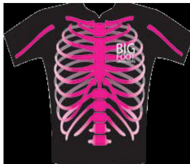
The dirty.d suit

I recommend you visit the dirtyd.co.nz website and at the Clothing design section go to the bottom. Designs are flowing in for Little Foot and Big Foot O suits! The Bones suit is currently the winner so unless the majority want otherwise we are going with it Here are some Little Foot Proposals: