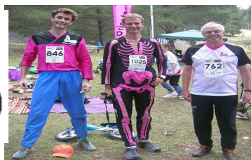
An historical view of Big Foot "O" Suits (showcased by models)